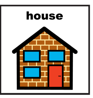
You can go home after the mammogram. The results will be sent to you in the post.

If you want to stop at any time tell the mammographer.